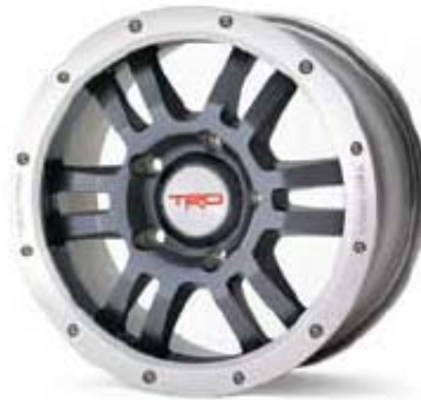
Tundra, Sequoia PTR45 34120 17" x 8 TRD Alloy MSRP* $400.00/wheel