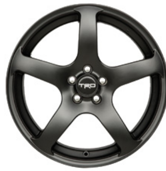
Corolla, Matrix, xD PTR18 21060 18" x 7.5 TRD Alloy MSRP* $275.00/wheel