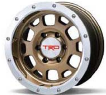
FJ Cruiser, Tacoma PTR18 35090 BR 16" x 7.5 TRD Alloy MSRP* $300.00/wheel