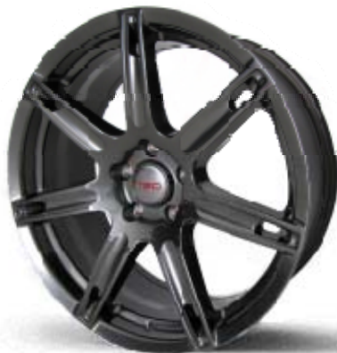
tC PTR56 21110 19" x 8 TRD Alloy MSRP* $250.00/wheel