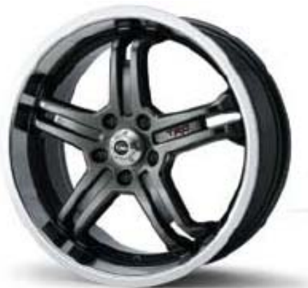
xB Gray: PTR20 52084 / Black: PTR20 52110 19" x 8 TRD Alloy MSRP* Gray: $250.00/wheel MSRP* Black: $300.00/wheel

*Please note MSRP price is part price only, does not include taxes or installation