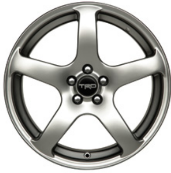
Corolla, Matrix, xD PTR18 21070 18" x 7.5 TRD Alloy MSRP* $275.00/wheel