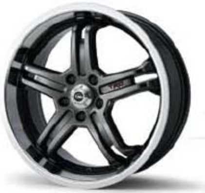
Matrix PTR20 12080 19" x 8 TRD Alloy MSRP* $300.00/wheel